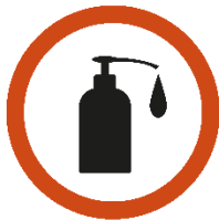
Use Soap or Hand Sanitizer