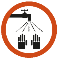
Wash Hands Thoroughly