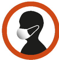
Use Face Mask

We encourage the use of masks throughout the parade, but masks must be worn when social distancing isn't possible. This includes, but is not limited to, parade line-up.